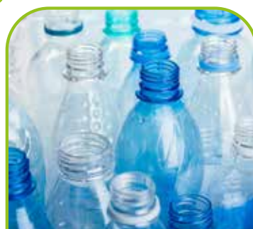
Old plastic bottles ready to go in the recycling bin