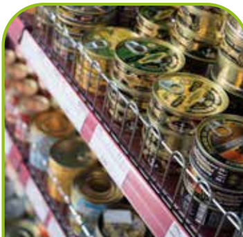
New recycled tins and cans in the shops