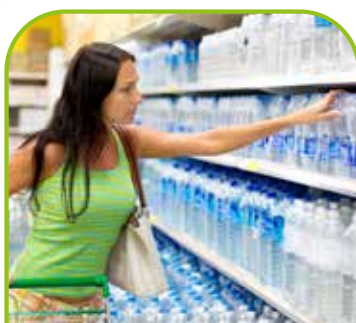
New recycled plastic bottles in the shops