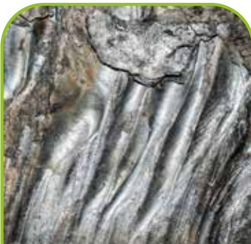
Tins and cans melted at the foundry