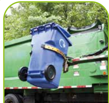
Recycling bin collected