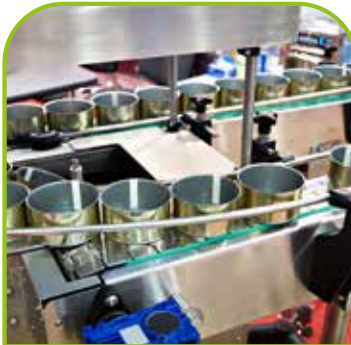
Recycled into new tins and cans