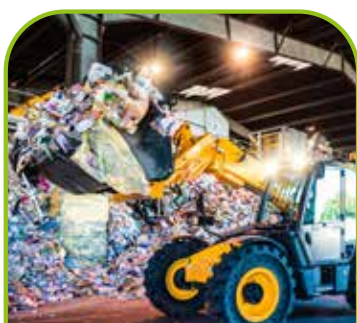
Sorted at the Materials Recovery Facility (MRF)