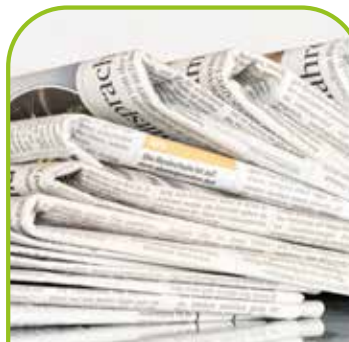
Old paper ready to go in the recycling bin