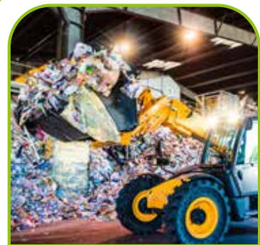
Sorted at the Materials Recovery Facility (MRF)