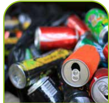
Old tins and cans ready to go in the recycling bin