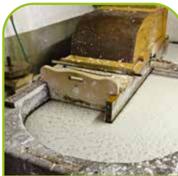
Paper is pulped in a paper mill