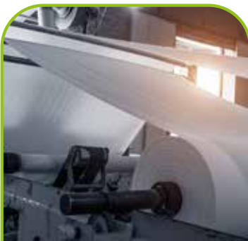
New paper being printed