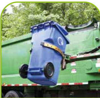
Recycling bin collected

The Waste Warriors need your help to find out how paper is recycled. Cut out the pictures below and put them in the correct order to show how it happens. You can then draw arrows to show how the pictures make a loop which can start again.