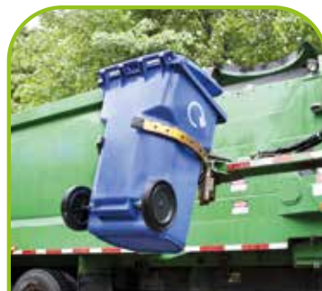
Recycling bin collected