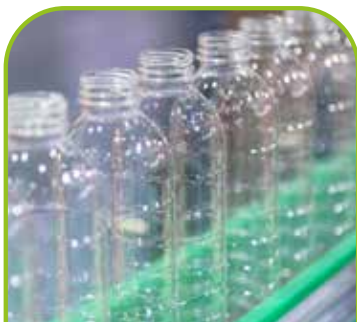
Recycled into new plastic bottles

The Waste Warriors need your help to find out how plastic bottles, pots and tubs are recycled. Cut out the pictures below and put them in the correct order to show how it happens. You can then draw arrows to show how the pictures make a loop which can start again.