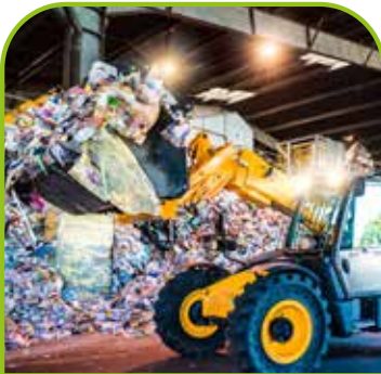
Sorted at the Materials Recovery Facility (MRF)

The Waste Warriors need your help to find out how metal tins and cans are recycled. Cut out the pictures below and put them in the correct order to show how it happens. You can then draw arrows to show how the pictures make a loop which can start again.