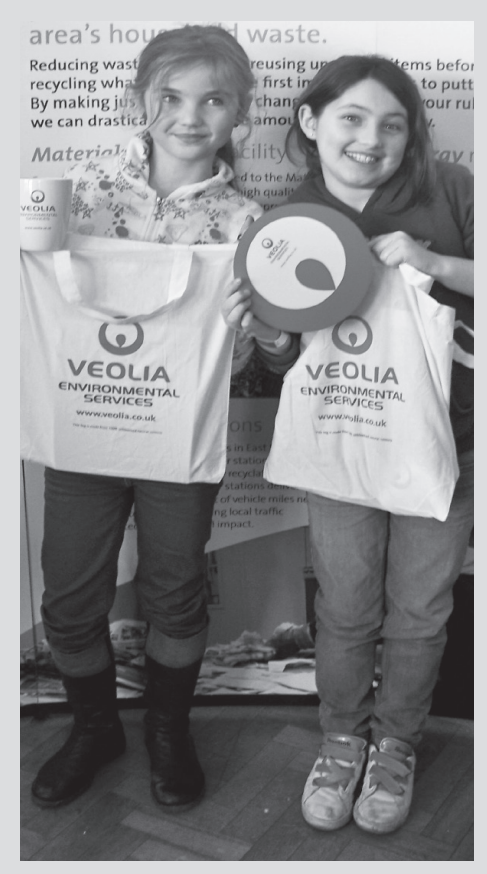
Kids take up the recycling challenge and win prizes!

Veolia Environmental Services – masters of recycling spent a weekend in February showing Kids in Brighton aged 7-14 what and how they can recycle and capture the imagination of kids young and old.