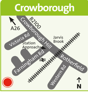
Mon - Fri: 9am - 5pm Sat - Sun: 9am - 1pm Bank Holidays closed