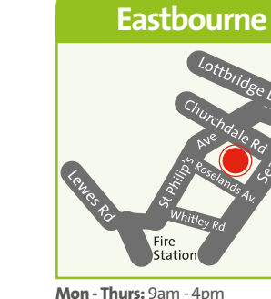
Fri: 9am - 3.30pm Sat & Sun: 8am - 12 noon Bank Holidays Closed