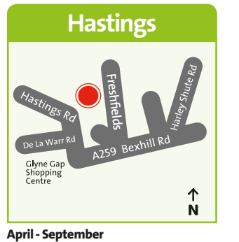
Mon - Sun: 9am - 6pm October - March Mon - Sat: 8am - 4pm Sun: 9am - 4pm