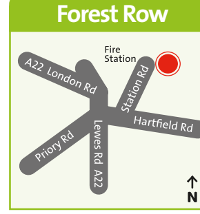
October - March Fri - Sat: 8am - 4pm Sun: 9am - 4pm