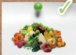
Fruit and vegetables