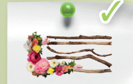
Small branches and flowers