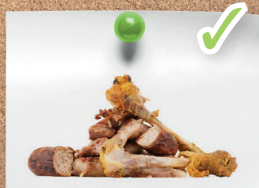
Meat, fish and bones