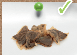
Tea bags and coffee grounds