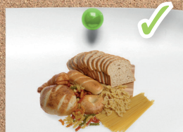
Bread, pasta and rice