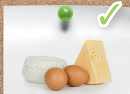
Eggs and dairy products