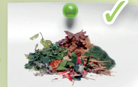
Grass cuttings and hedge clippings