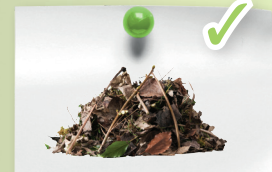
Leaves and prunings