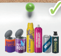
Food tins, drink cans and aerosols