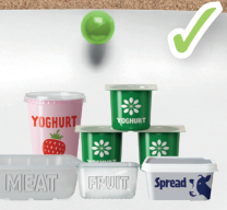
Plastic containers and food trays