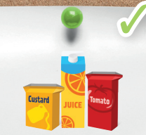
Food and drink cartons (Tetrapaks)