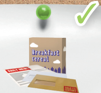
Paper and cardboard