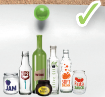
Glass bottles and jars