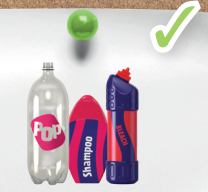
All plastic bottles