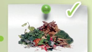
Grass cuttings and hedge clippings