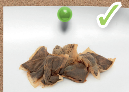
Tea bags and coffee grounds