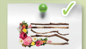
Small branches and flowers