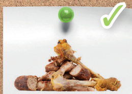
Meat, fish and bones