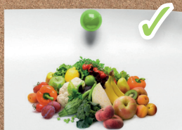
Fruit and vegetables