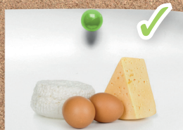
Eggs and dairy products