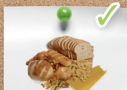
Bread, pasta and rice