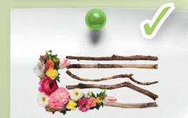
Small branches and flowers