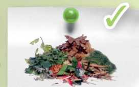
Grass cuttings and hedge clippings