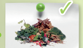
Grass cuttings and hedge clippings