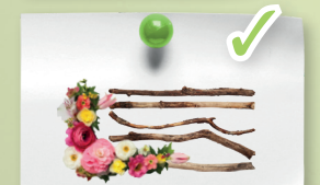
Small branches and flowers