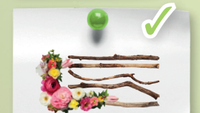
Small branches and flowers