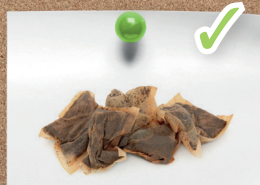
Tea bags and coffee grounds